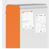
Optionally with magnetic pages