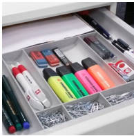
utensil drawer for office supplies