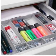
utensil drawer for office supplies