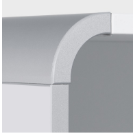
Rounded aluminum profile corners