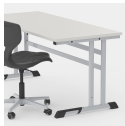
Due to C-shape no disturbance of the table legs when getting in and out of the table