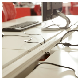
Plate slides on sliding fitting for concealed cable routing, sealed with rubber lip