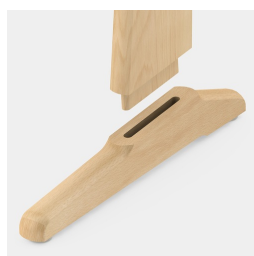
Durable and robust construction; firmly mortised and glued