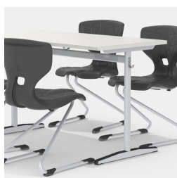
Seating on both sides due to central column frame