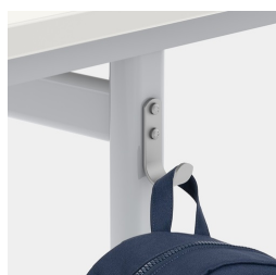
Includes one satchel hook per seat