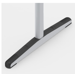
Floor protector with continuous step protection