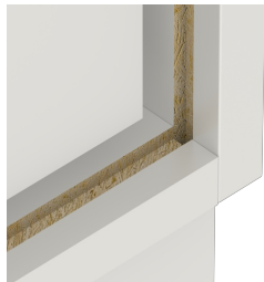
Resistance to warping due to 8 mm thick back wall