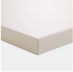
Board material melamine coated with robust plastic edge