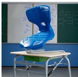
Plate protectors protect the table when stacking up

Robust Z-shape frame with A2S FLOORSAFE® floor protectors