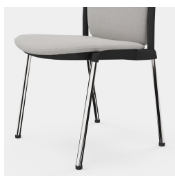
Robust 4-leg frame