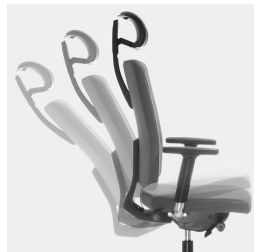
Self-weighting synchronous mechanism automatically adjusts spring force or resistance