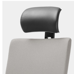
Headrest with leather cover: height and angle of inclination adjustable