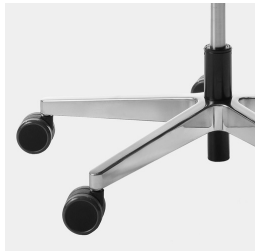
Elegant, high-quality aluminum base