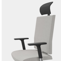
Ergonomically shaped backrest