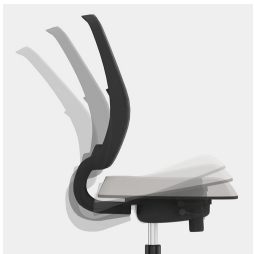
Synchronous mechanism: Spring force or resistance adjustable to body weight