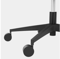
Elegant, sturdy black plastic base