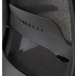
Black mesh backrest, with lumbar support adjustment