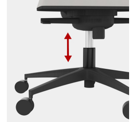
Stepless gas lift height adjustment