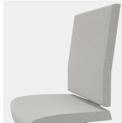
Ergonomically shaped backrest