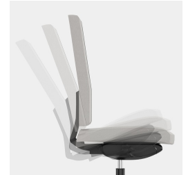
Self-weighting synchronous mechanism automatically adjusts spring force or resistance