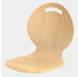
Optionally with kidney-shaped grip hole (not with backrest upholstery)