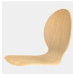
Body contoured seat shell