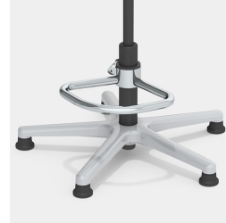
Optionally with partial foot ring