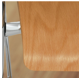
Seat shell environmentally friendly lacquered with water-based varnish