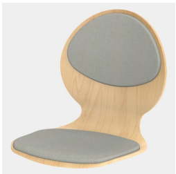
Optionally with seat and backrest upholstery