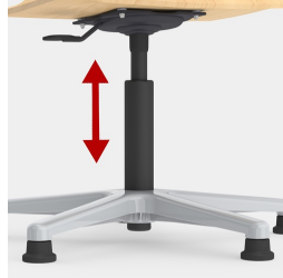
Height adjustment by safety gas spring