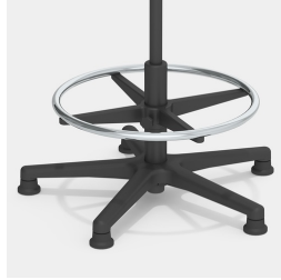
Elevation with chrome-plated foot ring, height adjustable