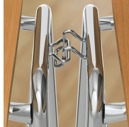
Frame including row connection