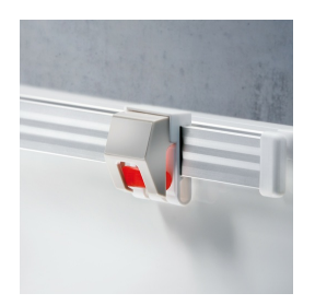
Optionally with picture clamping bar