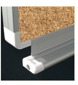
Matching shelf for chalk and pens