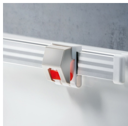
Optionally with picture clamping bar