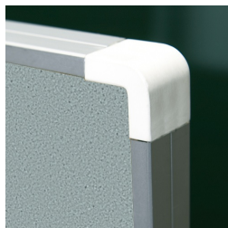
Edge protection due to rounded safety corners