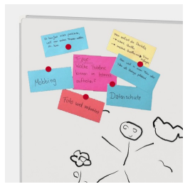
Magnetic surface can be written on with whiteboard pens

A2S-Furnishing Systems Ltd. ASS-Einrichtungssysteme GmbH info@a2s.com WWW.A2S.COM