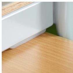
Plate protectors protect the table when stacking