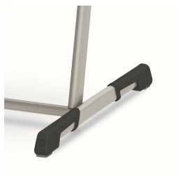
Floor protectors with integrated step protection