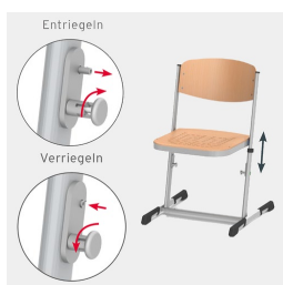
Multiple height adjustable through simple safety adjustment