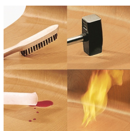
Seat and back melamine coated: scratch, break and impact resistant; flame retardant