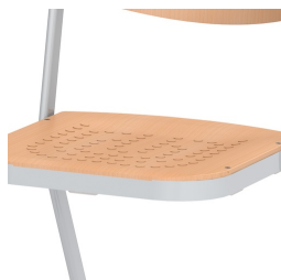
Seat surface with pressed-in, anti-slip knobs