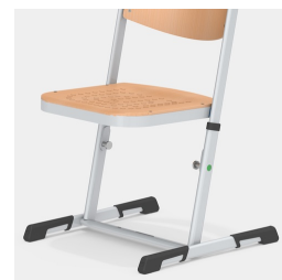
Stable, height-adjustable sled frame