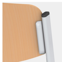
Seat and back concealed screwed