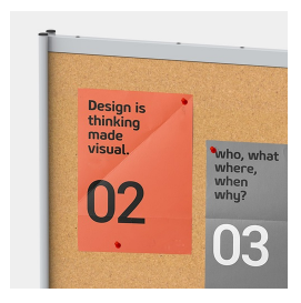
Optional covering in natural cork or cork linoleum