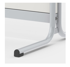
Base with plastic floor protectors