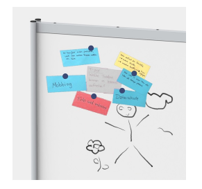
Magnetic surface can be written on with whiteboard pens