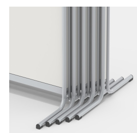
Can be nested to save space for storage

Our range of materials and colors can be found in the A2S material overview.