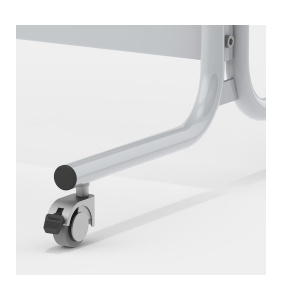
Base optionally with casters