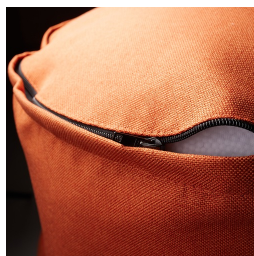
Cover removable by zipper