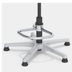
Optionally with partial foot ring