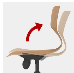
Optionally with 2D rocker