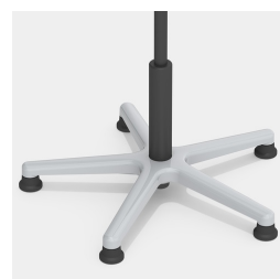
Extremely robust aluminum base