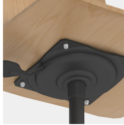
Height adjustment by safety gas spring