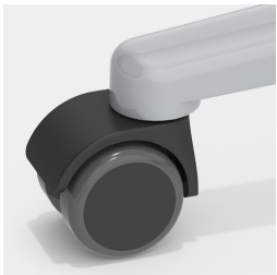
Optionally with load-dependent braked casters