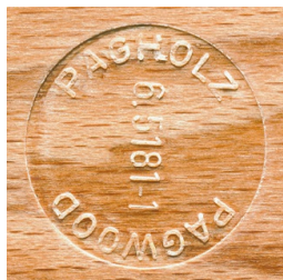
PAGHOLZ® from sustainable forestry