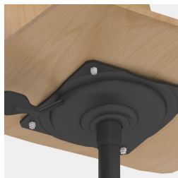
Height adjustment by safety gas spring