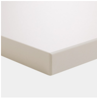
Board material melamine coated with robust plastic edge