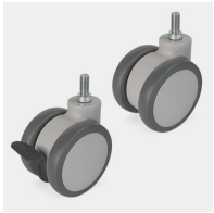
Mobile on 4 castors, 2 of which are lockable