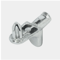
Pull-out proof shelf supports