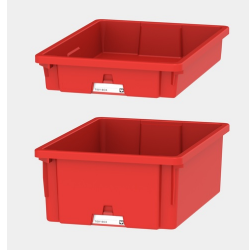
Tidy boxes for storing gloves, hats etc.