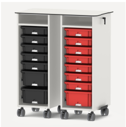
Zusätzliche Arbeitsfläche durch Aufsatzplatte