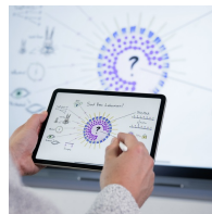
Simple screen transmission from all end devices