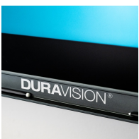
Full-length storage strip for pens