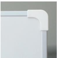
Edge protection due to rounded safety corners