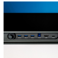
Connections integrated directly in the housing