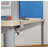
Mounting by means of Allen screw on the table top