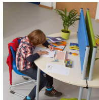
Ideal as a view and sound insulation