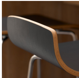
Robust beech multiplex shell with scratch-resistant CPL coating