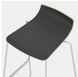
Invisible fastening of the seat shell