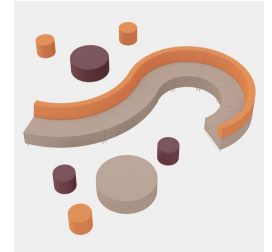
Can be combined with CYLINDA, BLOC and COMBi series