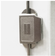
High quality locking bar