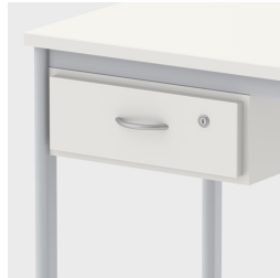
Including practical drawer under the table top