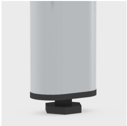
Floor protector with level compensation for easy levelling of uneven floors