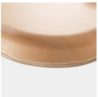
Optional WOODMARK table top in shatterproof quality