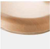
Optional WOODMARK table top in shatterproof quality