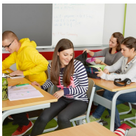
Due to C-shape no disturbance of the table legs when getting in and out of the table