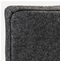
Saubere Befestigung mit stabiler Montageplatte, geschraubt