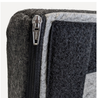
Abnehmbarer und waschbarer Bezugsstoff