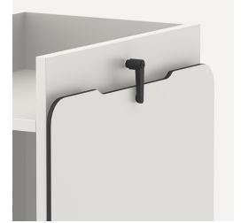
Verriegelung für Aufsatzplatte