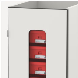
Die verglaste Front gibt freie Sicht auf die Materialien