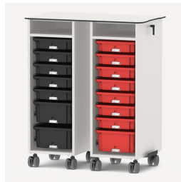
Zusätzliche Arbeitsfläche durch Aufsatzplatte