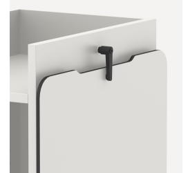
Verriegelung für Aufsatzplatte