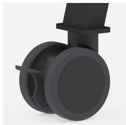
Vier große Doppelaufrollen jeweils mit Feststellbremse