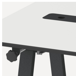
Multifunktional durch verschiedene Ausstattungsmöglichkeiten