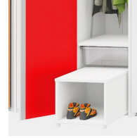
Pull-out stool that provides non-slip support.