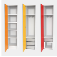
In 3 different equipment variants.