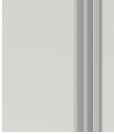
Cabinet-height handles keep the escape route clear and are easy to reach from any height.