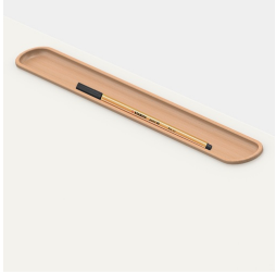
Including beech solid wood pen tray at the back