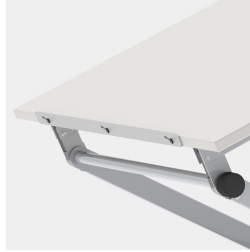
Optionally with book stop bar