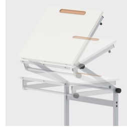
Sturdy, stable and infinitely adjustable frame made of metal