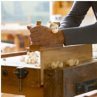
Solid beech wood from sustainable forestry with water-based varnish