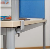
Mounting by means of Allen screw on the table top