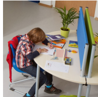
Ideal as a view and sound insulation