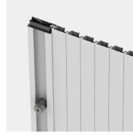
Stable guide rails