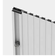
Stable guide rails