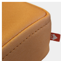
High quality crosscut seam