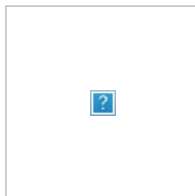
Optional mit geschraubter oder geklebter Bodenbefestigung