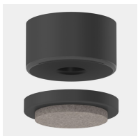
Optional felt floor protector with interchangeable insert