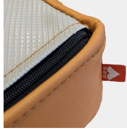
Zipper with concealed zipper