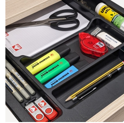
utensil drawer for office supplies