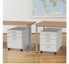
Suitable for our OFFICE tables and 1000, 2000 table series