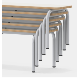
Stackable up to 5 benches