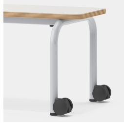
Optionally mobile by means of 2 castors (can be retrofitted at any time)